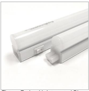
Fixture Ends with Integrated Plugs