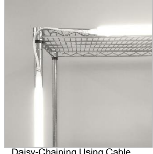
Daisy-Chaining Using Cable