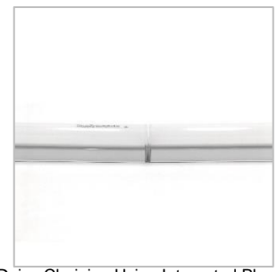
Daisy-Chaining Using Integrated Plugs