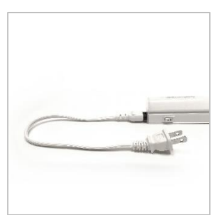
Fixture End with Plug-in Cord