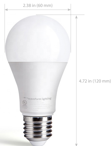
MECHANICAL DIMENSIONS (1:2 SCALE)