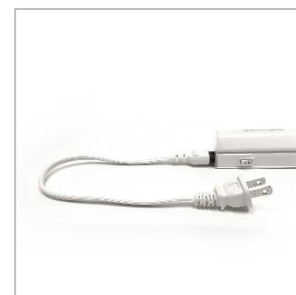
Fixture End with Plug-in Cord