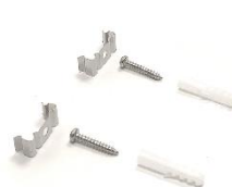
Screws, Anchors & Mounting Clips (2 pcs)