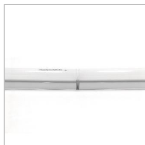
Daisy-Chaining Using Integrated Plugs