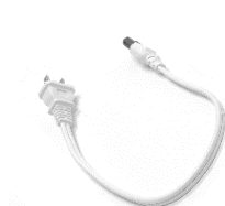
Power Cord (1 pcs) Length: 12 inches (30 cm)