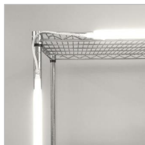
Daisy-Chaining Using Cable