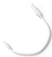
Daisy Chain Cord (1 pcs) Length: 12 inches (30 cm)