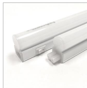
Fixture Ends with Integrated Plugs